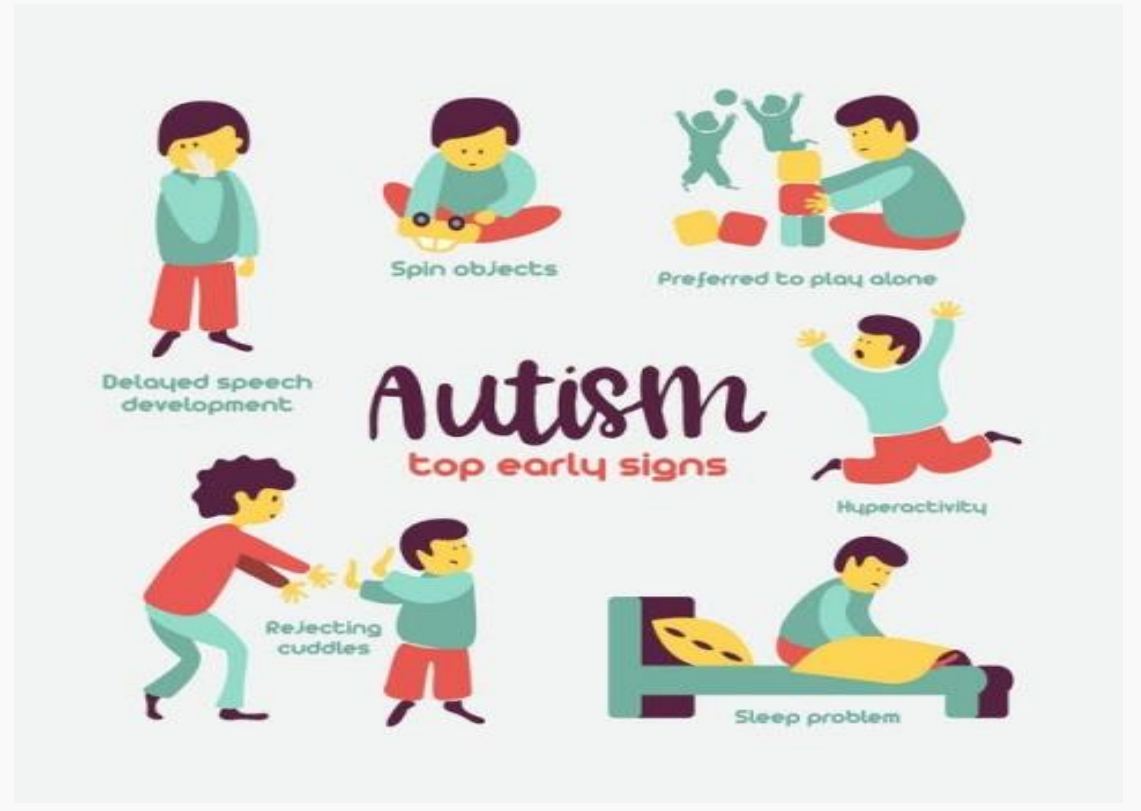
Figure: 01 DOI https://runwaypakistan.com/a-dummys-guide-to-autism-in-pakistan/

organisations in raising concern about autism, allowing it to be identified at an early age and care initiated appropriately.